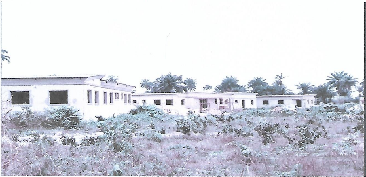
Construction in advance phases