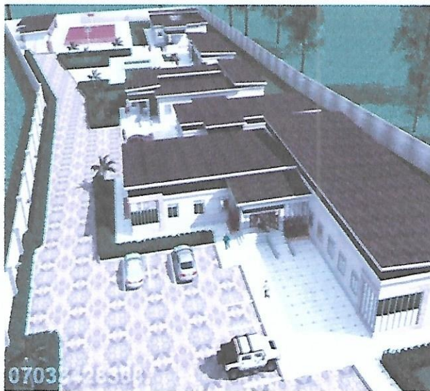
Over view of the proposed complex